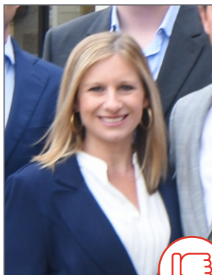
Cropped Group Photo